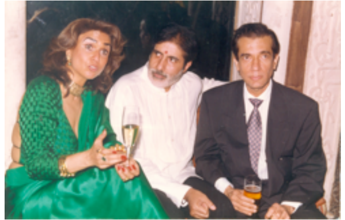
Figure 6: Indian socialite & philanthropist Parmeshwar Godrej, Bollywood superstar Amitabh Bachchan and Nari Hira at one of his famous rooftop house parties in South Mumbai