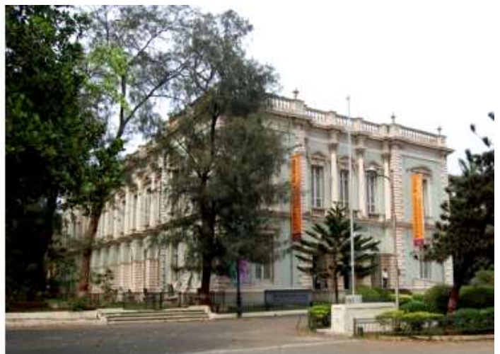
Figure 2. Dr Bhau Daji Lad Museum (V&A) (right).