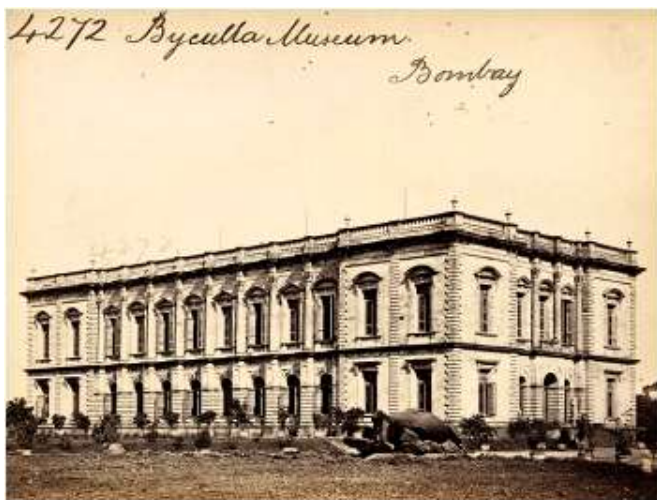
Figure 1. The V&A Museum (left). Photograph, Francis Frith, approximately 1870s. Web, Victoria and Albert Museum (London), 07/09/2012. http://collections.vam.ac.uk

The Victoria and Albert Museum and Victoria Gardens is a significant Colonial institution, which reflects the aspirations and failings of the Indian and British elites that controlled late nineteenth century Bombay. The Museum crystallises the responses of these individuals to changes in thinking in Britain and its Indian Empire. As time passed, and each decision was made, the Museum evolved, in reaction to changes in the current social, economic, and political events of Bombay, Britain, and the Empire. Furthermore, the effect of these decisions and the fluctuating changes in opinion were dramatically reflected in the development of the Museum due to the slow progress of the building over a decade from 1858 to 1872.