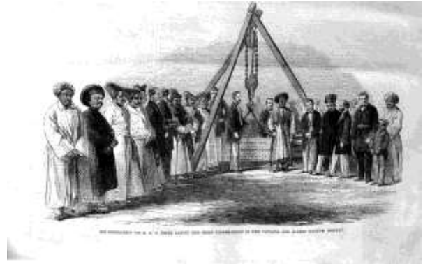
Figure 5. Sir Bartle Frere laying the cornerstone of the V&A Museum. Drawing. The Illustrated London News . London, 03/01/1863

on industrial products. 80 Daji, in 1871, also stated that the Museum was 'for illustrating the processes of important manufactures'. 81