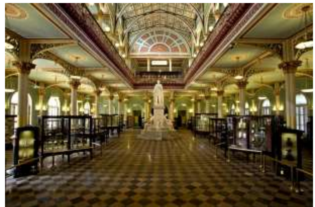
Figure 3. Dr. Bhau Daji Lad Museum (V&A), interior (top). Photograph, approximately 2010. Web, CPP-Luxury.com, 07/09/2012. < http://www.cpp-luxury.com >

that subsequently became part of the V&A. Due to the Indian Mutiny (10th May 1857-approximately 1859), an economic boom (approximately 1857-1865), and the effects of Enlightenment discourses, the native elite initiated the creation of the Museum and completed the Gardens by 1862. 2 After a recession in 1865, the interest shown by this group had dwindled, and the PWD (Public Works Department) took over responsibility, opening the Museum in 1872. The effect that these changes had on the Museum was substantial and can be identified within the form of the institution. From this web of events two questions arise concerning the Museum and Garden's formative history. Firstly, why did the native elite, who were so keen on the project, fail to retain an interest and, secondly, why would the PWD adopt a failing project which encumbered them for a further eight years?