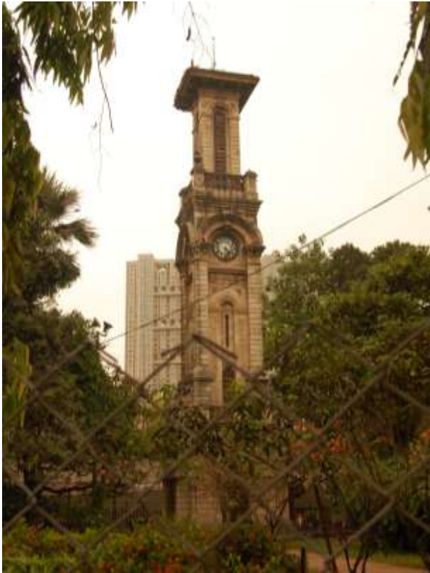
Figure 7. David Sassoon's Clock Tower. 18/04/2012

claiming, for example, that education will bring together these different peoples. 109 The Prince, when the Crystal Palace was opened, saw it as a place where the world could be united with international cooperation and friendly competition taking the place of war. 110 In memory of this opinion, the statue in the V&A is inscribed with English, Hebrew, Marathi, and Gujarathi representing the unity of Bombay; as the languages rest side by side so do the English, Jews, Indians, and Parsis of Bombay (figure 2). On the base are also female representations of art and science, suggesting