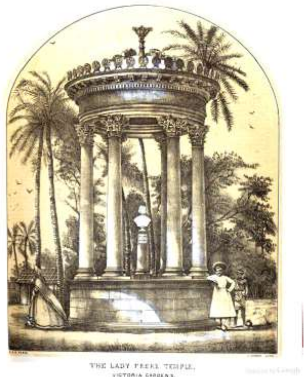
Figure 6. Lady Frere's Temple, Victoria Gardens. Drawing, in The Bombay Builder , 1865. Web, Google Books, 20/04/2012. < http://books.google.co.uk >

While Bombay was not directly affected by the Mutiny, the elite used the first meeting for the Museum as a platform to express their loyalty to Britain. It is possible that the Museum would not have materialised, or at least not for a while, if it had not been for this event. Every speech at that meeting was heavily laden with words of endearment aimed at securing the relationship between the native elite and the British government. Key words