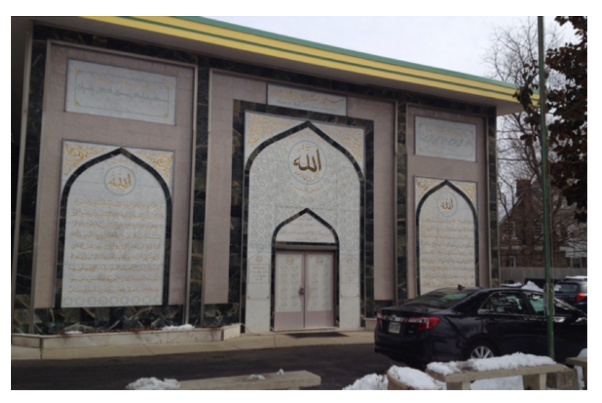
Figure 7. Masjid of Bawa Muhaiyaddeen in Philadelphia, Pennsylvania.