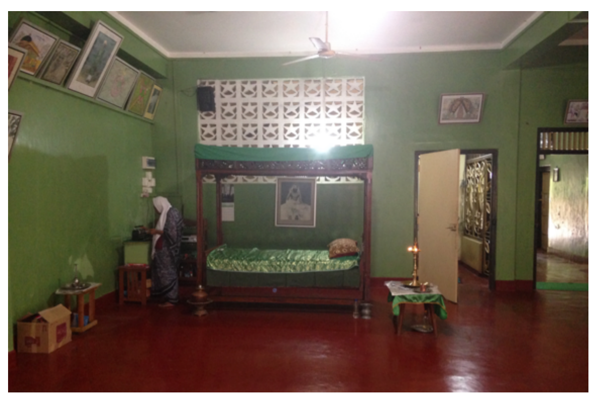
Figure 1. Prayer takes place in front of Bawa's bed and includes the lighting of an oil lamp and venerating the bed of Bawa.