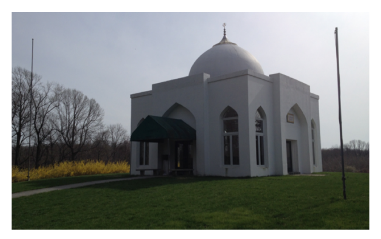
Figure 8. The mazar of Bawa Muhaiyaddeen in Coatesville, Pennsylvania.