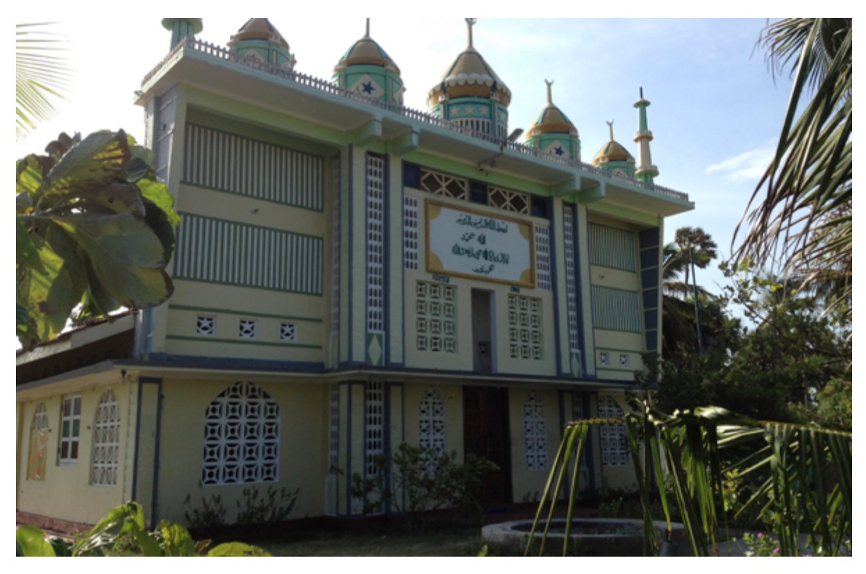
Figure 3. Above is a photograph of Mankumban on Velanai (or Kayts) Island in Jaffna, Sri Lanka during jum'a prayers.

In 1954 Bawa purchased the property that Mankumban sits on because of his understanding of this particular location's proximity to Maryam (see figure 2 and 3).<sup>13</sup>