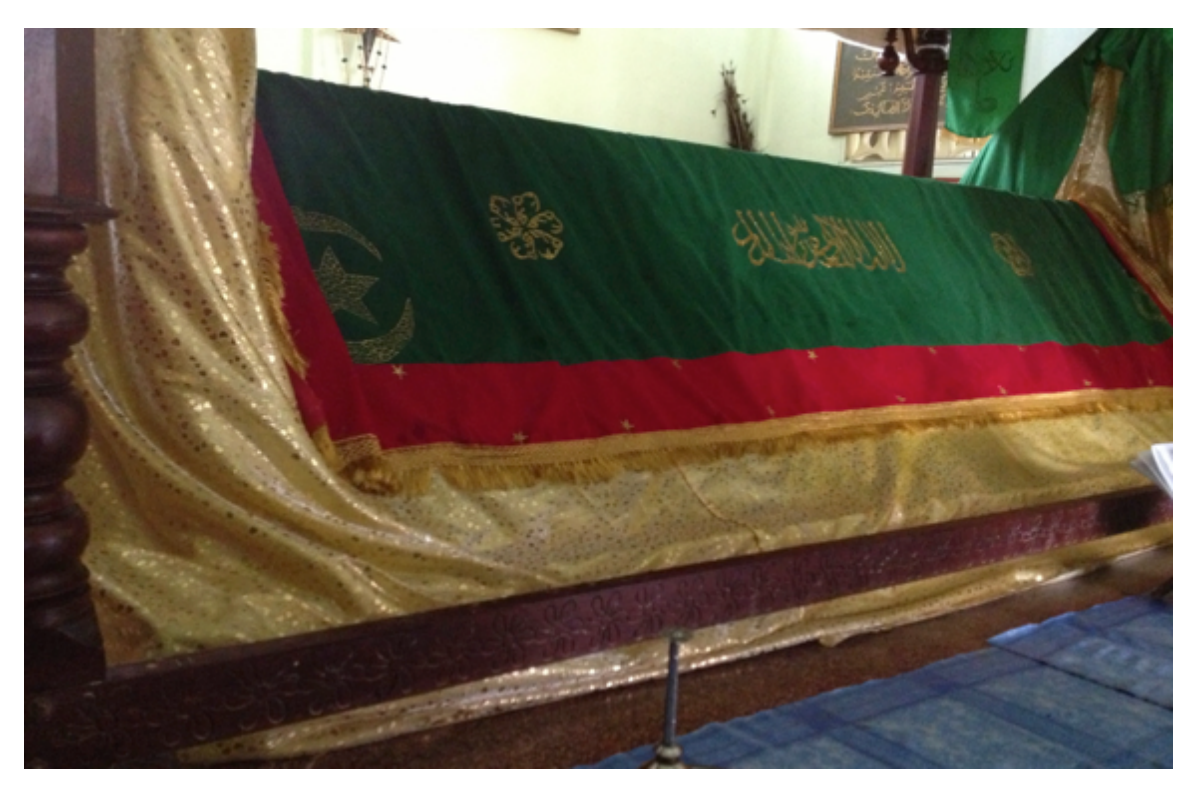
Figure 2 . Inside Mankumban in the main sanctuary of the tomb in honour of Bawa Muhaiyaddeen and Maryam (Mary), the mother of 'Isa (Jesus). Communal prayers took place in front of the tomb as well as individualised forms of veneration, such as circumambulation of the tomb. This tomb was removed in October 2017. Photograph by Merin Shobhana Xavier taken August 2013.

Figure 1. Prayer takes place in front of Bawa's bed and includes the lighting of an oil lamp and venerating the bed of Bawa. Photograph by Merin Shobhana Xavier.